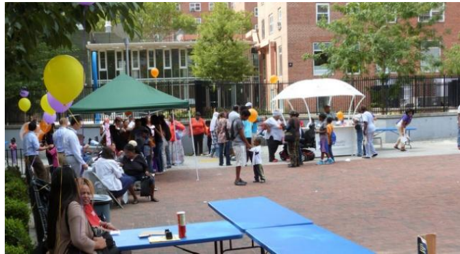
"Back to School Day" at Johnson Houses celebrated the inauguration of their Wireless Technical Campus