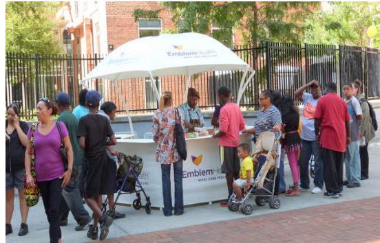
NYCHA seniors and families gather information on healthcare insurance at Johnson Houses Family Day