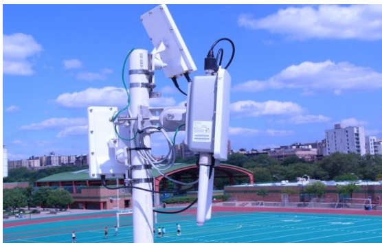
DDP Wi-Fi Radio at Riverbank State Park