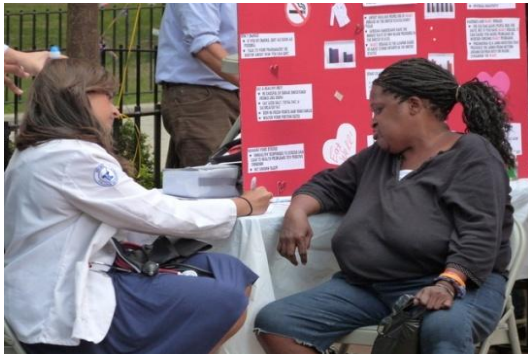
Healthcare Screening at Johnson Houses enhanced with free Wi-Fi provided over Wireless Technical Campus